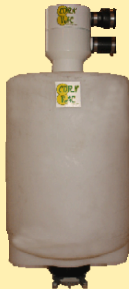
25 Gallon Secondary Tank