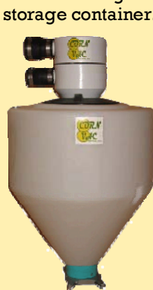
15 Gallon Secondary Tank