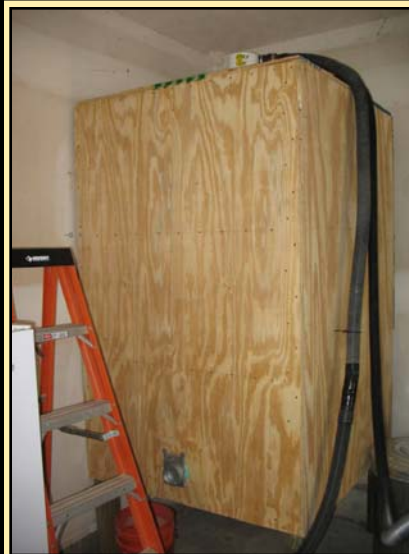
The Completed storage bin will Clean, Transfer and Store 55 Bushels of Corn.