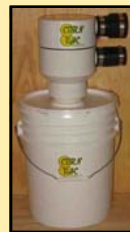
5 Gallon bucket with cleaner.

The Secondary Tank is used for stove/furnace owners to have an alternate location for loading corn into their stove/furnace. This unit can be hung over top of you stove/furnace and used to directly load on a daily basis, or you can hang this tank anywhere that is convenient to load a bucket of corn to transport to your stove/furnace. The owner could also use this tank to load their own larger storage container by hanging the secondary unit over their storage bin. We carry a 15 and 25 Gallon Secondary Tank. We also offer a 5 gallon bucket with a lid that will accept our Cornvac Cleaner. You can clean 5 gallons at a time and dump it directly in your stove or a larger storage container.